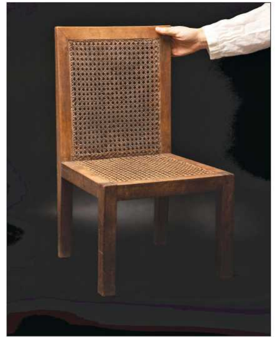
A chair used by the great Anglo-German artist Lucian Freud as a boy (£2/3,000).

Sworders is at GES and Sons Limited on Cambridge Road. For information, www.sworder.co.uk .