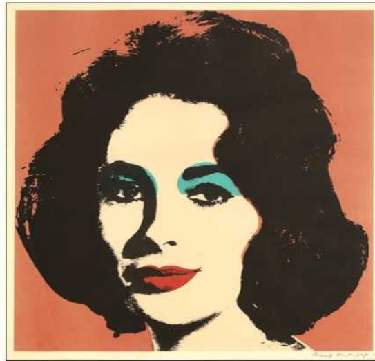
Andy Warhol (American, 1928-1987). "Liz" (F. & S. II. 7) (£25/35,000).